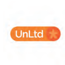
UnLtd: The Foundation for Social Entrepreneurs